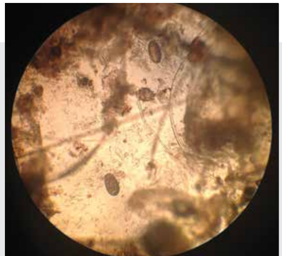
FIGURE 4. Sarcoptes scabiei .