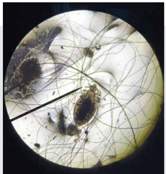
FIGURE 1. Canine sucking louse, Linognathus setosus .