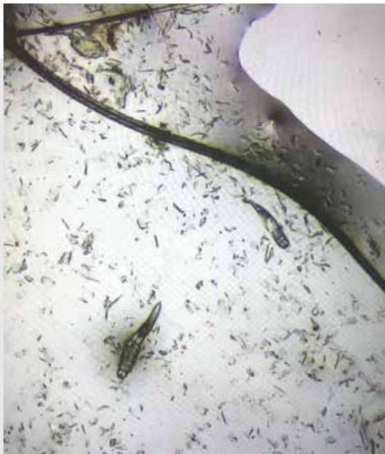
FIGURE 6. Adult Demodex canis mites. Magnification, 10×.