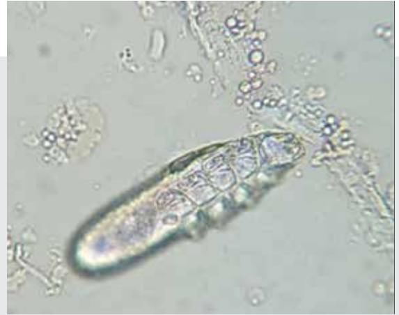
FIGURE 9. Demodex gatoi .

Figure 9: