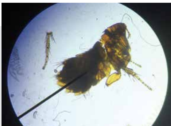
FIGURE 2. Adult flea, Ctenocephalides felis felis . Magnification, 10×.

All in-contact animals need treatment and environmental measures are often required.