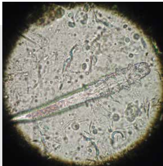
FIGURE 8. Demodex cati .