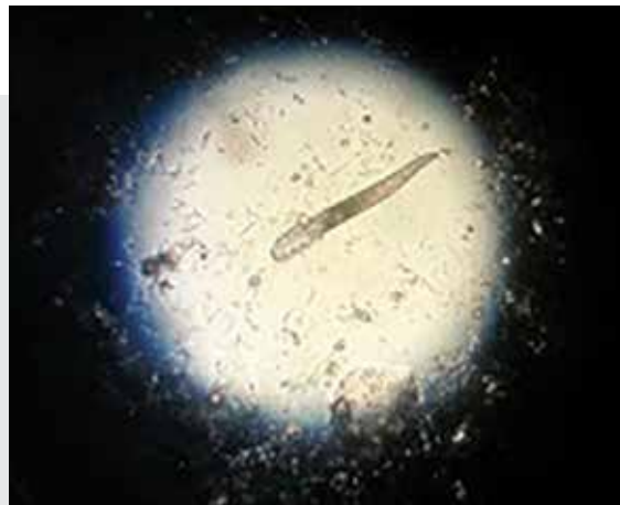
FIGURE 7. Demodex injai .